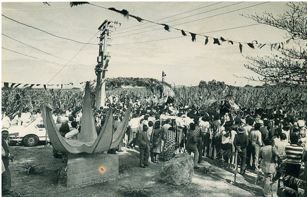
Fig. 5 - Gathering on the inauguration day, 2 nd September 1983