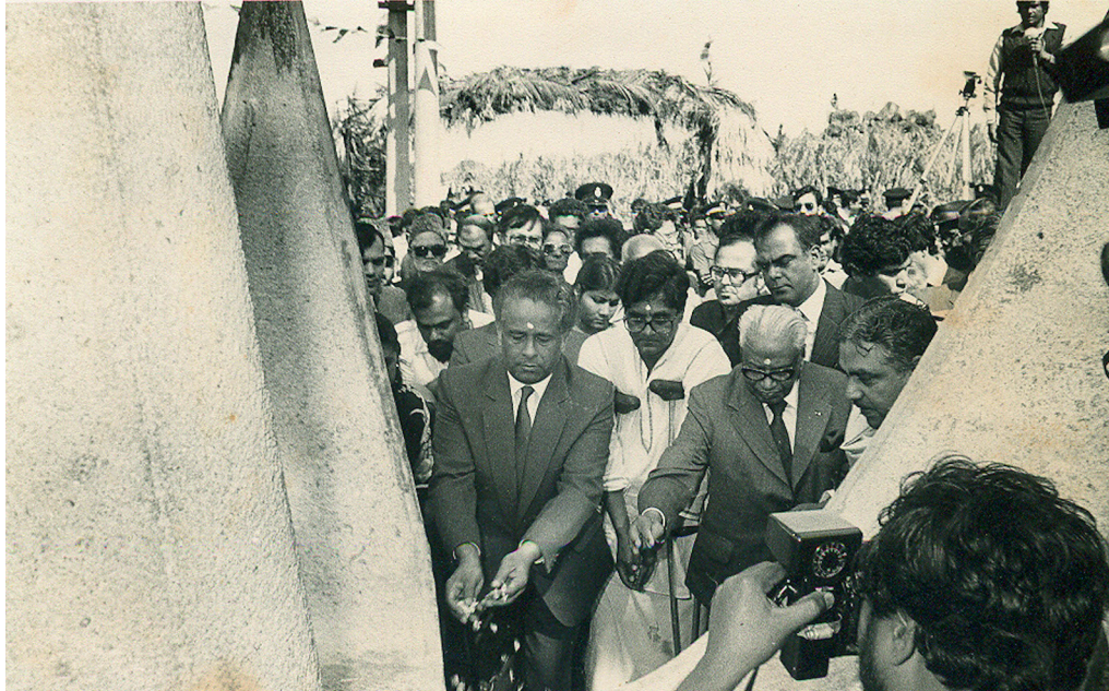
Fig. 4 - The Inauguration ceremony, 2 nd September 1983