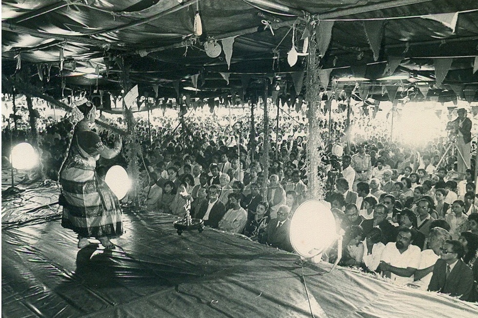
Fig. 6 - A dance performance in the evening celebration, 1983