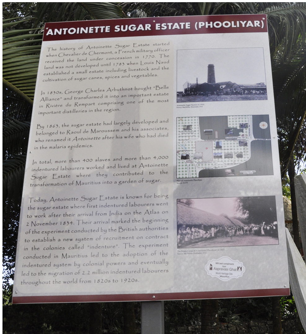
Fig. 2 - The Information board, 2018