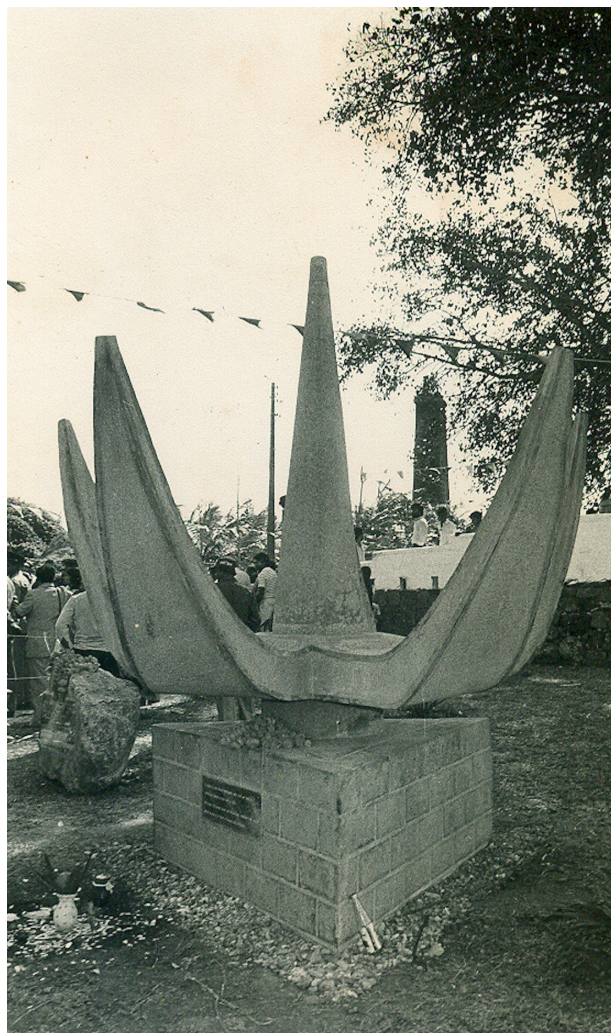
Fig. 8 - Phooliyar Monument with the view of the chimney of Antoinette sugar estate 1983

her drawings of the chimney; then she composed it in-between the petal forms and create an illusion of a blooming floral sculpture; after that it visually jagged through photograph. Her desire was to create an impression of the chimney of the sugar factory not only through the monument, but also through the photographs. Mala explored the visual reasoning of photography that she learned from the history of indenture labour photo as well as her academic training at the art schools.