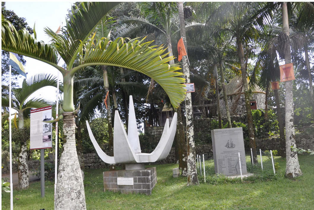
Fig. 1 - Phooliyar Monument, 2018